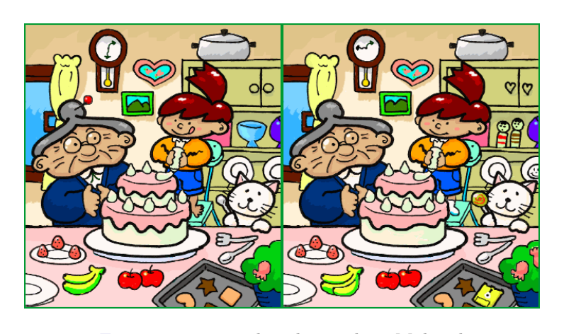
Figure : source: wikipedia, author: Muband